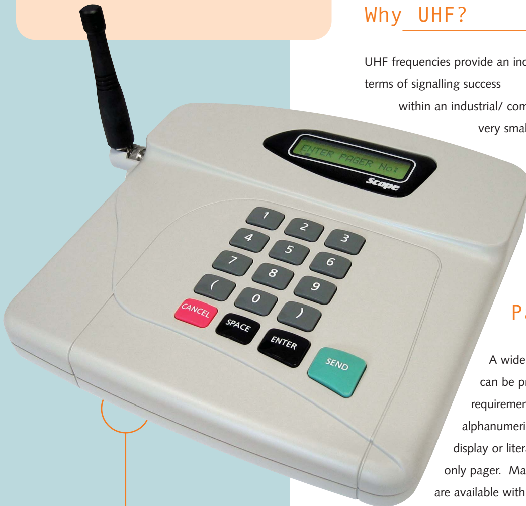
DataPage Lite transmitter

*Note that DataPage Lite can only send numeric characters.